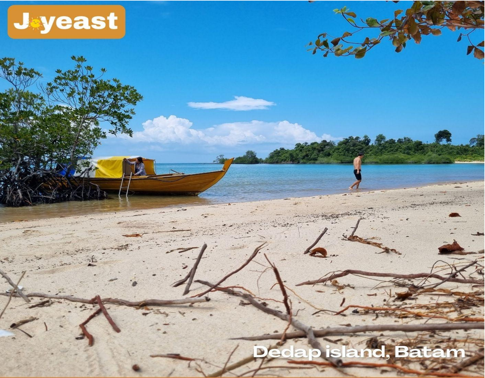
Dedap island, Batam